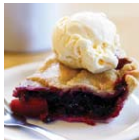
(previous page) scenic Two Medicine Lake; (this page, top) Big Mountain; (above) huckleberry-peach pie from Loula's; (right) The Lodge at Whitefish Lake

Waltz through Flathead Valley, watching the park's peaks leap into view as you wind closer to the town of West Glacier. Meet your tour for the day at 3 Glacier Guides . With a deli lunch packed, the guide will orient you to the park's history, geology, wildflowers, and diverse fauna—especially grizzly bears.