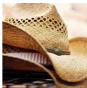
(top) a rousing, dousing excursion with Glacier Raft Company; (above) cowboy hats for sale; (right) breakfast at Montana Coffee Traders

After dinner, amble outside to lounge on the deck. In three days, you've seen a lot, breathed lots of fresh air, and actively engaged one of the most memorable slices of America's great outdoors. You've earned the simple luxury of watching the alpenglow of sunset smear Glacier Park with pink. Becky Lomax first saw Glacier when she was 3, but she still marvels at its beauty. After being a hiking guide in the park for 10 years, she authored Moon Handbooks: Glacier National Park.